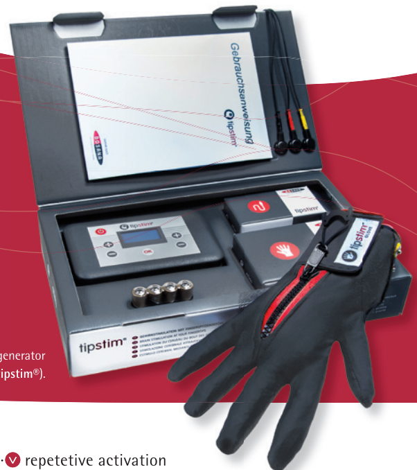
glove and pulse generator (tipstim® glove und tipstim®).

Plastic processes of human brain – neuroplasticity – modify our perception and behavior throughout life. Usually, there is a need for intensive training to induce neuroplasticity. In particular damage to the brain caused by injury or stroke call for intense and long-lasting rehabilitation processes.